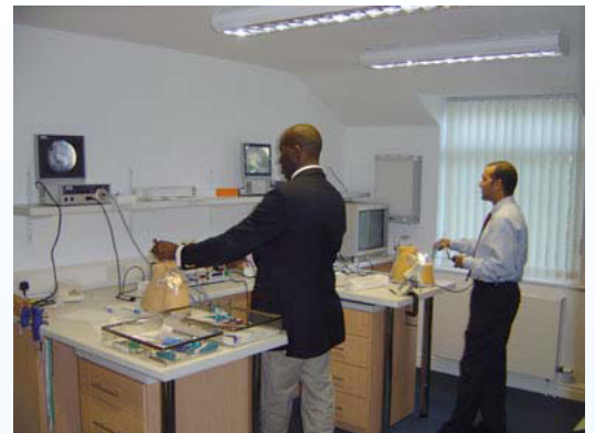
The shoulder fellows practising in the RSU Bio-skills Laboratory

As part of the shortlisting process applicants may be expected to complete a brief test paper within time constraints, details of which will be provided at a later stage.